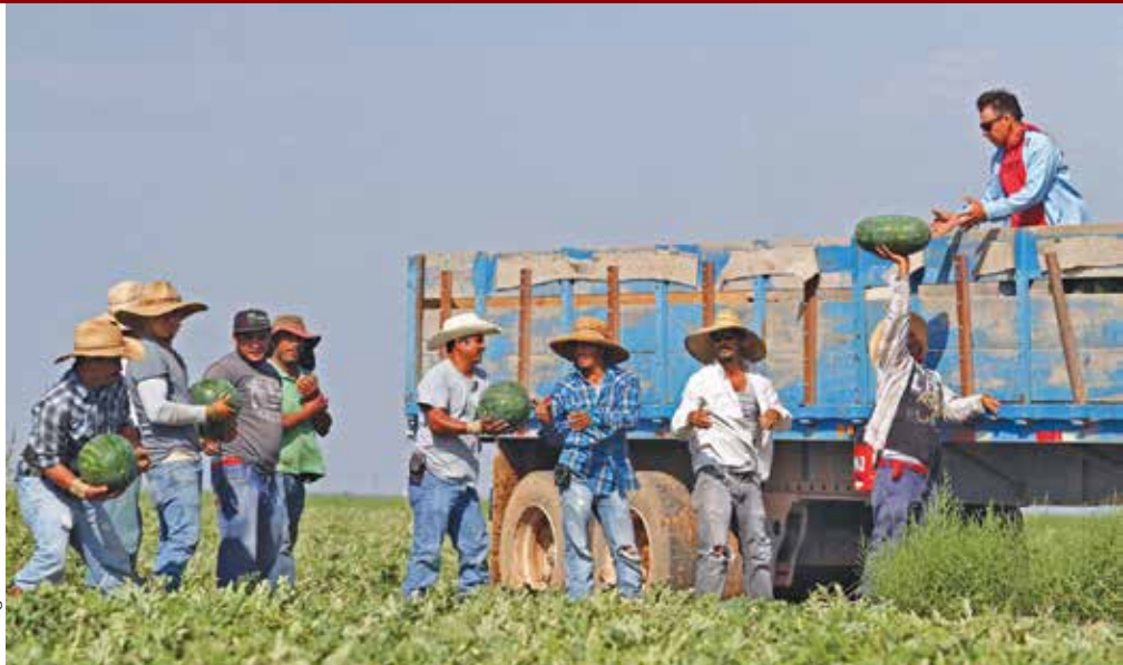
Mi casa, su casa: Chapters 17 and 23 of the USMCA potentially open borders of the United States to the migration of foreign nationals, and provide legal protection for illegal aliens employed in the United States.

Though there are often short-term economic advantages of "free trade agreements," such as the USMCA's new access to the Canadian dairy market allowing U.S. farmers to sell their cheese and milk products to Canadian retailers and consumers, the pluses pale in comparison to the long-term cost and consequences of losing national sovereignty — sovereignty