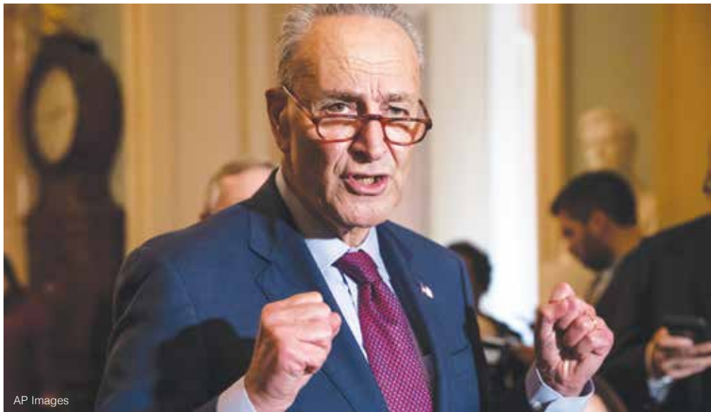
Schumer sides with Trump? In a rare display of bipartisan support, Senate Minority Leader Chuck Schumer (D-N.Y.) praised President Trump over the new USMCA, signaling possible support from Democratic lawmakers in the incoming 116th Congress in 2019.

Chapter 23 of the USMCA could also serve as a beachhead for a cross-border migration invasion similar to that experienced in the European Union. In language that is virtually identical to that found in the TPP, Article 17.5 of Chapter 17 of the USMCA states: "No party shall adopt or maintain ... a measure that ... imposes a limitation on ... the total number of natural persons that may be employed in a particular financial service sector or that a financial institution or cross-border service supplier may employ ... in the form of numerical quotas or the requirement of an economic needs test." This opens the door for Mexico and its incoming radical socialist government or for a Mexican, a Canadian, or even a U.S.-based company to sue the U.S. government for restricting the number of employees that such a company would want to bring across the